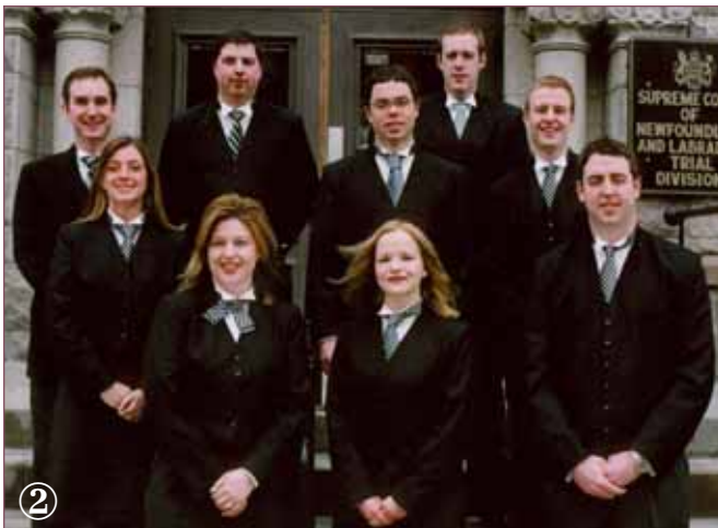
Photo #2 - Call to Bar April 11, 2005