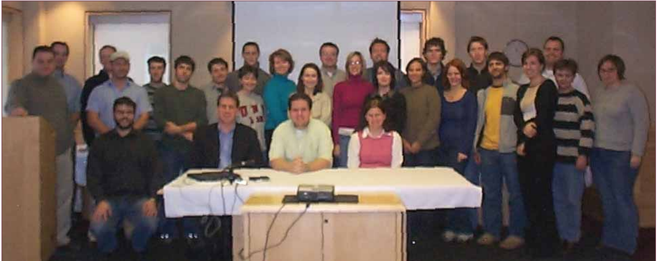
Students-at-Law attend the 2005 Bar Admission Course in St. John's